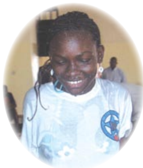
Christen after baptism

another $4,000 has been donated to Praise International for the construction of another well. The well under construction will eliminate the need to carry water by hand over long distances.