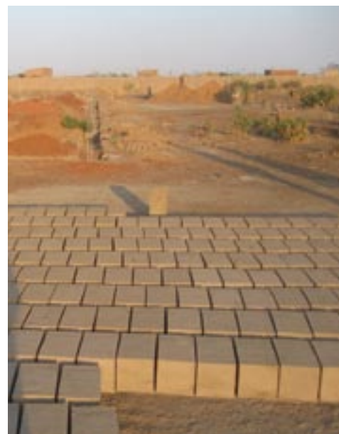
Hand-made bricks drying in the sun

They are required to provide their own uniforms, backpacks and supplies. Your gifts in any amount would be greatly appreciated. Thank you for praying about what God would have you do in this dynamic work in Mali.