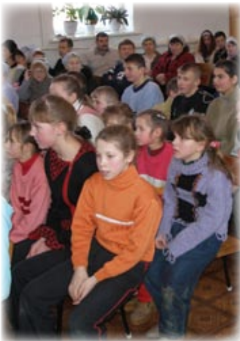
Children at the Christmas Program

January 2-10 of this year I had the wonderful privilege to be part of a team that visited the Tambov region of Russia. In a partnership that included Praise International, The Slavic Gospel Association, and a coalition of churches centered in Idaho, we were able to help our Russian brothers share the gospel in a great outreach in the Tambov region. Funds were raised through the churches to purchase Christmas gifts for children that included a beautifully illustrated Children's Bible in the Russian language. Children and families were invited to come to the local churches to hear the Christmas story and receive the gifts. The outcome was literally amazing.