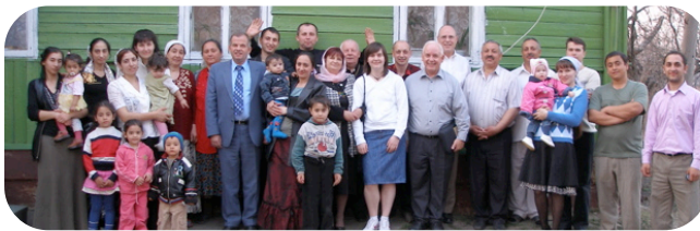
Members of the gypsy church outside the building where they are meeting